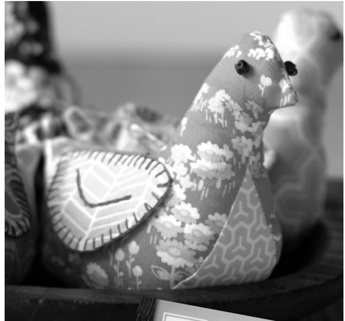
1 OF 25 ECLECTIC MODERN SEWING PROJECTS FROM "JOEL DEWBERRY'S SEWN SPACES"